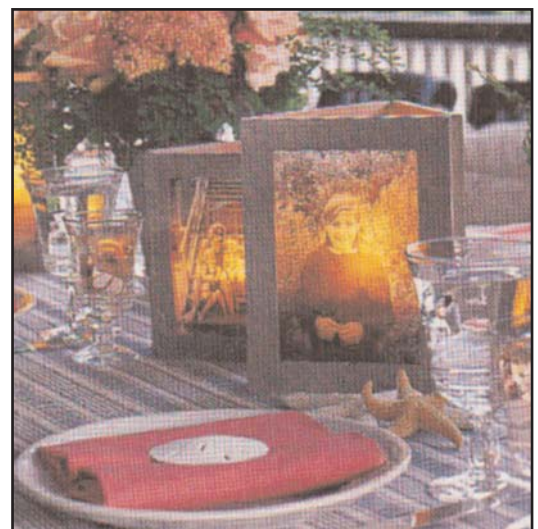
The decorative lanterns combine the beauty of candlelight with the memories associated with cherished photographs.

All donations will be used for community outreach.