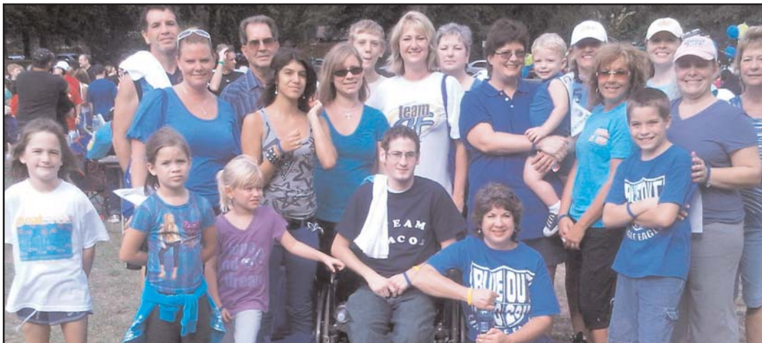
Rose Rudman Park, Tyler, TX